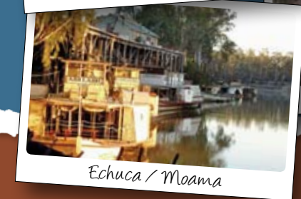
Echuca / Moama