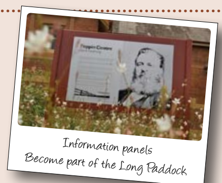
Information panels Become part of the Long Paddock

The information panels are located at significant sites along the Cobb Highway. They are a wonderful mixture of truths, tales and images! To really experience the drovers' dream stop at each panel and become part of The Long Paddock. Watch for The Long Paddock Visitor Site signs telling you when the next sign is coming up.